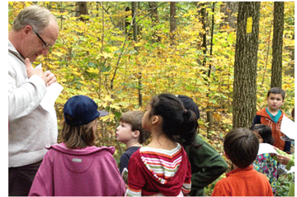
Nature Walk at Morrison Farm

AB PIP STEM sells Acton Naturally, Guide to Local Species . These guides, sponsored by AB PIP STEM and the AB Schools, are available for $6 at PIP STEM events and fundraisers. To find out more, email actonpip@gmail.com .