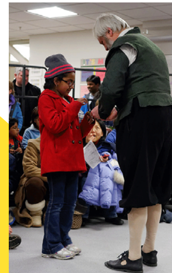
4th Grade Star Party